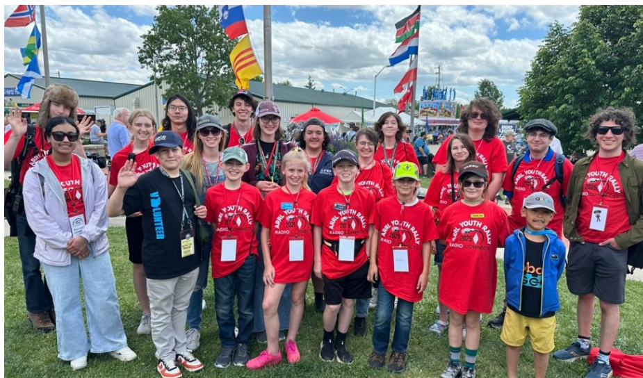
Photo from 2025 ARRL Youth Rally. Caption: ARRL Youth Rally participants at 2025 Dayton Hamvention®.

ARRL Youth Rally Registration https://pci.jotform.com/form/260975827202158